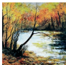
2 Autumn Pixies Mere , Hemel Hempstead acrylic & ink