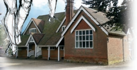
The Village Hall Hastoe