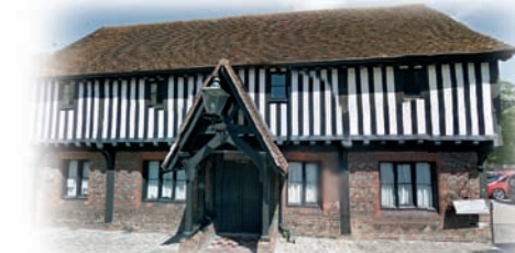
The Court House Berkhamsted