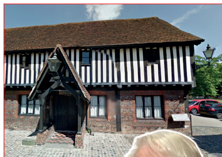
The Old Courthouse

Having this option means that sketching evenings with like-minded souls will not be dictated by the uncertainties of weather. There are many ideal spots for plein-air sketching within a stones-throw of the Courthouse - the church area, the canal, the buildings to note but a few. The Courthouse itself is a charming venue, as used for our life-drawing winter evenings - portrait drawing of each other springs to mind !