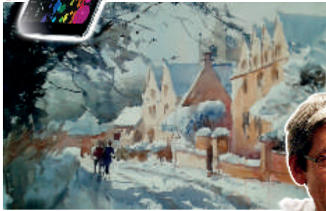
Keith's finished work

There are clearly a variety of different ways of producing digital art and, as a fair trial, it has been decided to include members digitally-produced artwork for the first time at our forthcoming Exhibition as stated in Frances Evershed's comment overleaf. Such works will be subject to a few basic rules which are included in the Exhibition Rules issued with the entry forms.