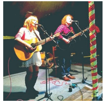
We will have some singing accompaniment on the Sunday opening day, courtesy of the singing couple Starseedz