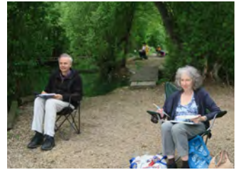
Summer drawing evenings get under way at picturesque Pixies Mere.

Summer drawing Monday evenings will be May 9 until August 22 at 6.30 pm, weather permitting.