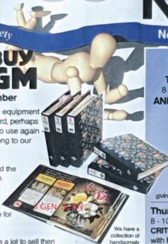
We have a collection of handsomely bound back-dated issues of Leisure Painter which are likely to be going for a song at the AGM

During the course of the evening there will also be an auction of paints and pastels donated to the Society.