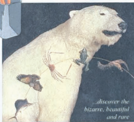
...discover the bizarre, beautiful and rare

The current exhibition (up to 14 October) - 'The Bizarre, Beautiful and Rare' - gives an opportunity to see wonderful natural objects from the Natural History Museum collections which are not normally on public display.